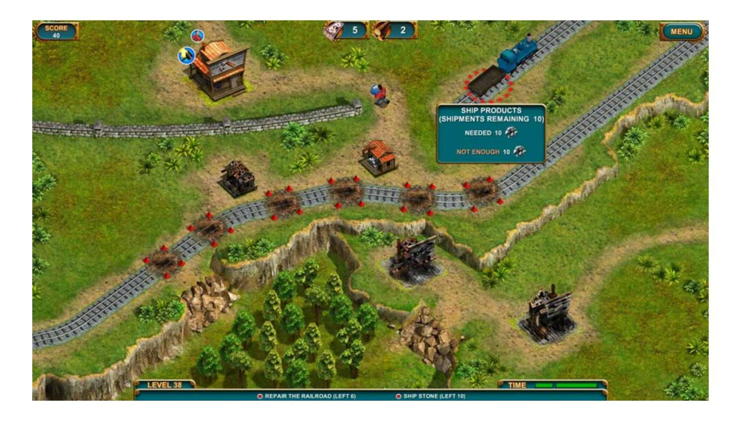
Next Stop 2 Full Crack [key Serial Number]

Download ->>->> <a href="http://bit.ly/2NFlDIa">http://bit.ly/2NFlDIa</a>